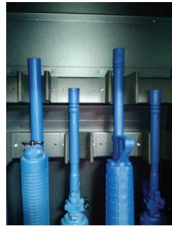
Variable Height Adjustment for barrel support