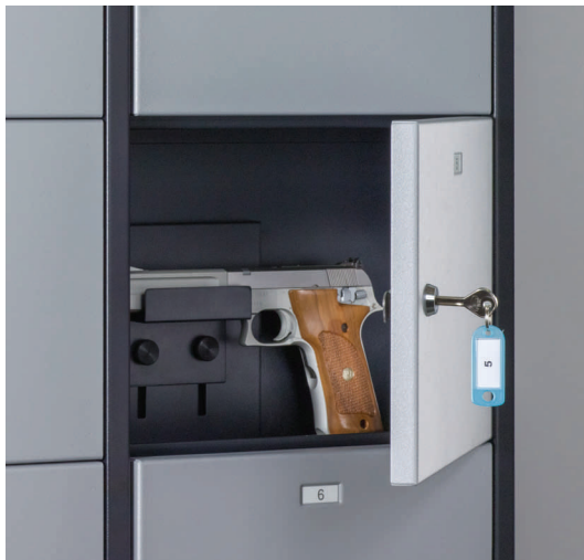
Adjustable Pistol Holder

Precision Locker Company Jamestown, NY 1-877-243-5094 www.precisionlocker.com